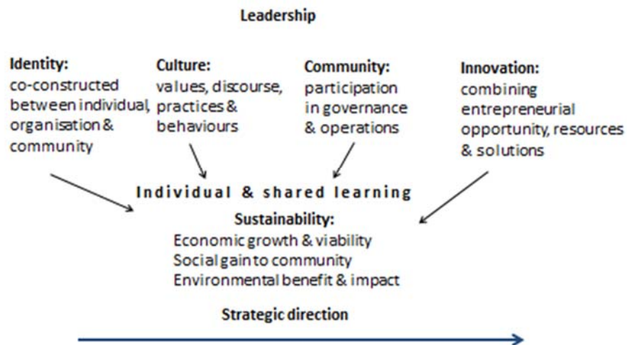
Figure2: Leadership for sustainability in entrepreneurial organisations